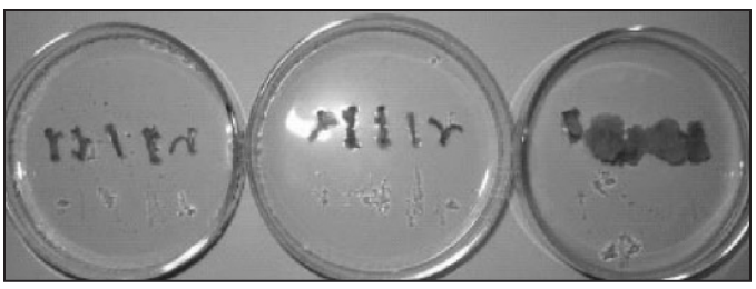
tact = 60 min tact = 30 min Control The effect of MRET water on the growth of kallus tissue (mutated psoriasis cells of botanical origin)